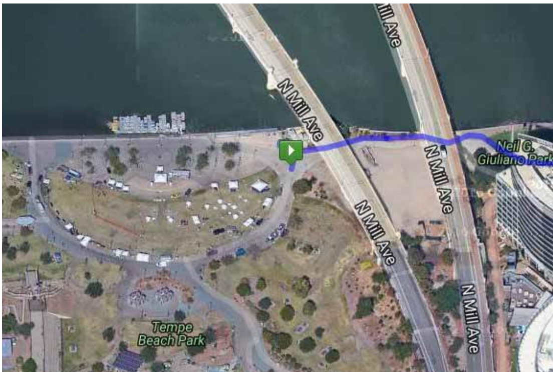
Phoenix Race – Course 2

Route is a simple out-and-back route starting from under the bridge on N. Mill Ave (at Tempe Beach Park).